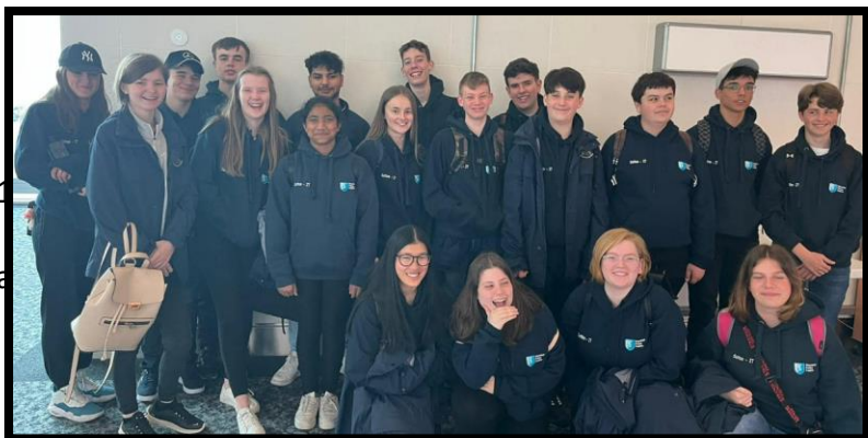
Cadets from the Metropolitan Police VPC, Sutton Unit set off from London for 3-day visit to Amsterdam

Day 1 of their trip saw visits to Zaanse Schans where there are historic windmills and distinctive green wooden houses to recreate the look of an 18/19 Century village a boat trip across the river, a walk-through Amsterdam seeing the palace, shops and canals, a canal trip and then a tram trip back to Central Station.