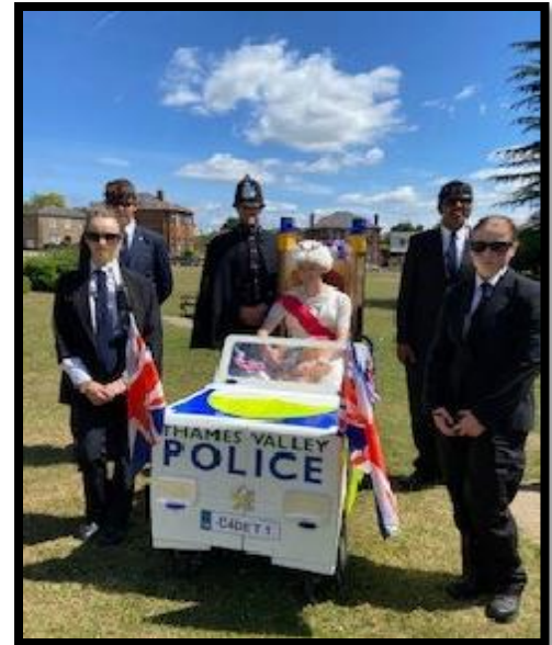
Original float design

The cadets came 1st in the competition winning £200 for their unit and the float has been donated to a local school for the children to play in.